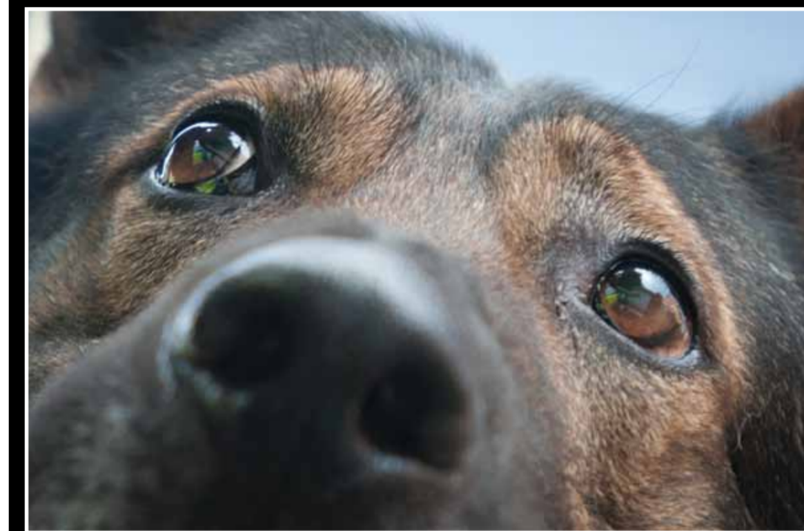
Police dogs are real blood hounds: Four German Shepherds have been trained to sniff out blood at crime scenes. It is the first time Kent Police dogs have been taught to find blood evidence on objects, weapons or a trail. The clever canines can detect the scent despite masking agents or cleaning materials being used to remove evidence.