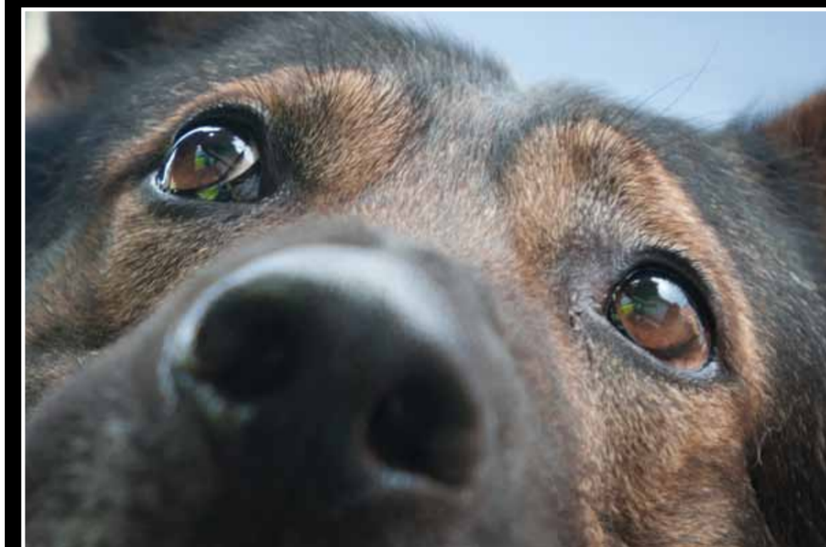
Police dogs are real blood hounds: Four German Shepherds have been trained to sniff out blood at crime scenes. It is the first time Kent Police dogs have been taught to find blood evidence on objects, weapons or a trail. The clever canines can detect the scent despite masking agents or cleaning materials being used to remove evidence.