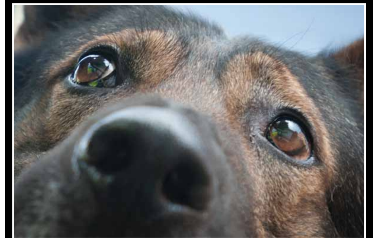
Police dogs are real blood hounds: Four German Shepherds have been trained to sniff out blood at crime scenes. It is the first time Kent Police dogs have been taught to find blood evidence on objects, weapons or a trail. The clever canines can detect the scent despite masking agents or cleaning materials being used to remove evidence.