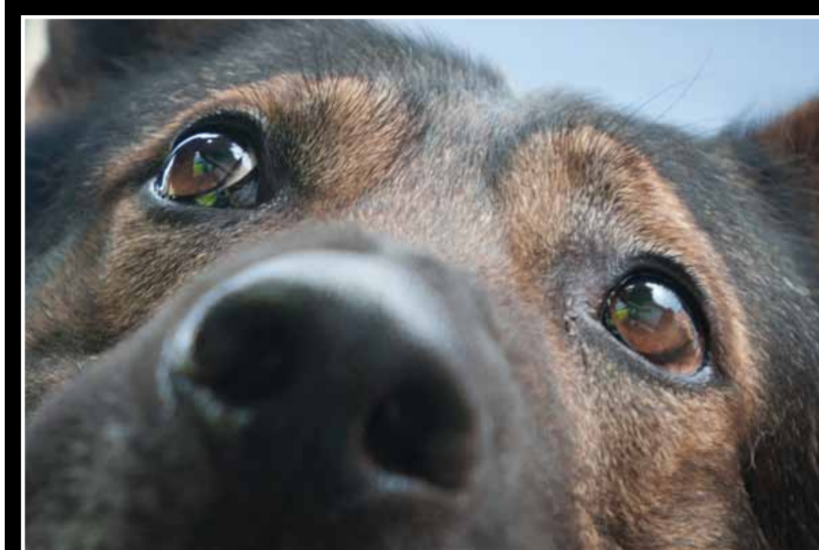
Police dogs are real blood hounds: Four German Shepherds have been trained to sniff out blood at crime scenes. It is the first time Kent Police dogs have been taught to find blood evidence on objects, weapons or a trail. The clever canines can detect the scent despite masking agents or cleaning materials being used to remove evidence.