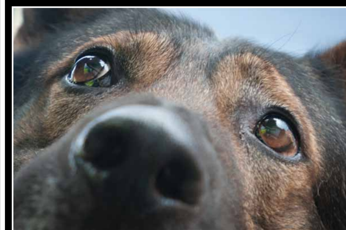
Police dogs are real blood hounds: Four German Shepherds have been trained to sniff out blood at crime scenes. It is the first time Kent Police dogs have been taught to find blood evidence on objects, weapons or a trail. The clever canines can detect the scent despite masking agents or cleaning materials being used to remove evidence.