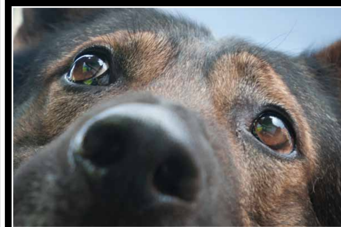
Police dogs are real blood hounds: Four German Shepherds have been trained to sniff out blood at crime scenes. It is the first time Kent Police dogs have been taught to find blood evidence on objects, weapons or a trail. The clever canines can detect the scent despite masking agents or cleaning materials being used to remove evidence.