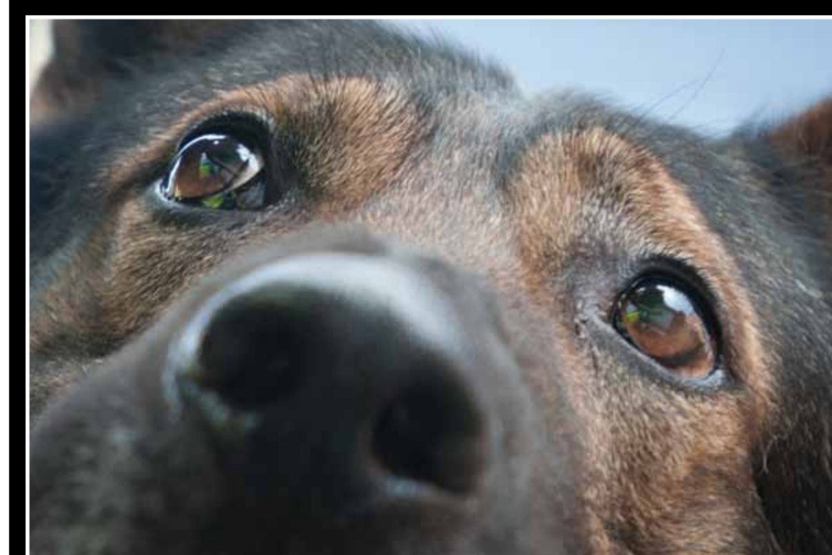
Police dogs are real blood hounds: Four German Shepherds have been trained to sniff out blood at crime scenes. It is the first time Kent Police dogs have been taught to find blood evidence on objects, weapons or a trail. The clever canines can detect the scent despite masking agents or cleaning materials being used to remove evidence.