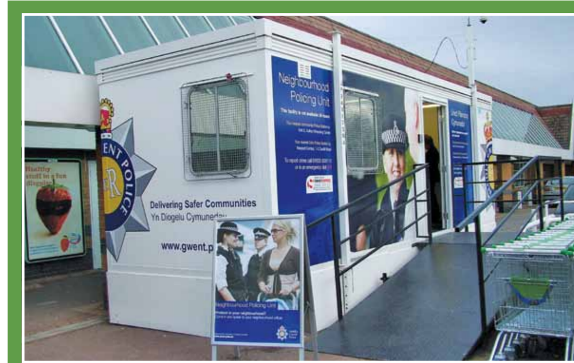
Example of a pod used by Gwent Police